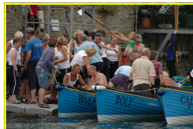
Changeover at Salcombe